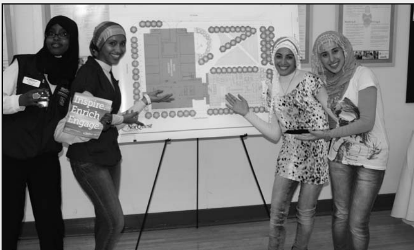
NorQuest College students show off a diagram of the College's proposed North Learning Centre at the PC Leadership Candidates' Reception, which was held at the Westmount Campus on July 26, 2011. The North Learning Centre is a future priority for NorQuest and one of many subjects discussed at the reception.