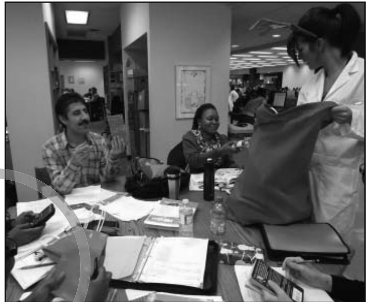
Stress Bustin' Santa - Students' Council was out and about handing out special treats for evening students and students studying in the library just before exams.