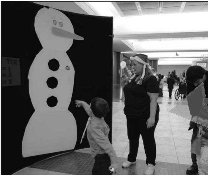
Students' Association Holiday Party - students and their families enjoyed a fun-filled holiday party that included delicious multi-cultural food, games and pictures with Santa.